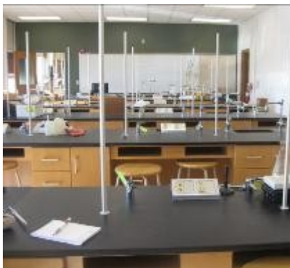
Updated science lab