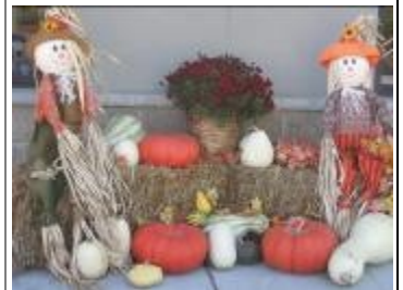
Beautiful fall display in front of Strasburg Shortstop, assembled by Becky Ulmer.