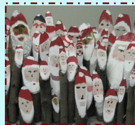
Black Forest Santas